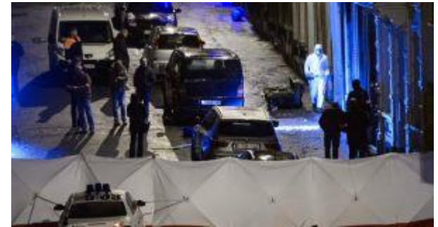
15/01/2015, Arrestations - Verviers