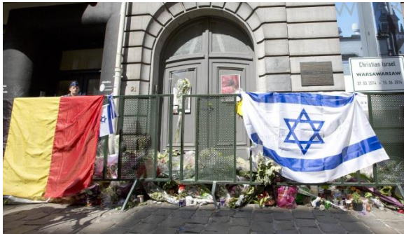
24/05/2014, Attack Jewish museum - Brussels